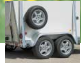
Accessories/extra equipment, page 9