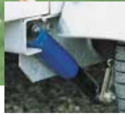
The special rubber torsion axles provide individual suspension on all four wheels – resulting in a smooth and comfortable ride.