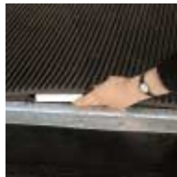
Shock-absorbent, ribbed, removable rubber mat provides optimal protection for the horses legs.