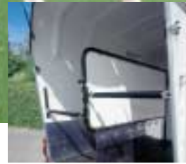
The chest- and the butt bars can easily be set in different heights in order to adapt the horsetrailer to different horses.