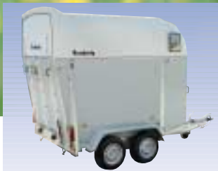
Prestige horse trailer, page 6