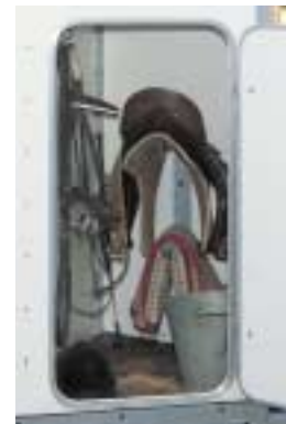
The Royal TC model features a built-in tack compartment with an interior light and holders for two saddles.