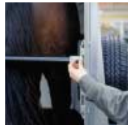
Easy to open or close the butt bars. Snap release system on the butt bars.