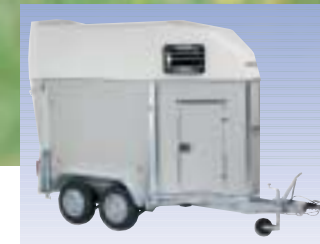
Solo horse trailer, page 8