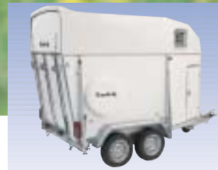
Royal horse trailer, page 7