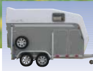
Baron horse trailer, page 4